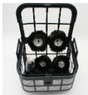
Side brushes and screws are in the filter basket